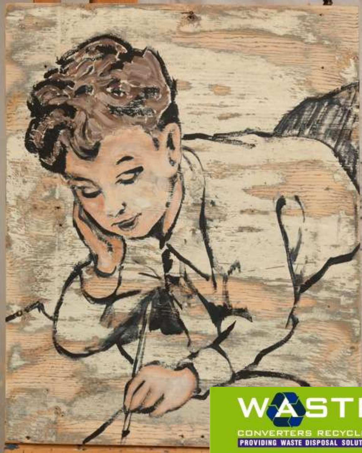
David Bromley painting on Viridian Glass plywood.

WASTE CONVERTERS RECYCLING PROVIDING WASTE DISPOSAL SOLUTIONS