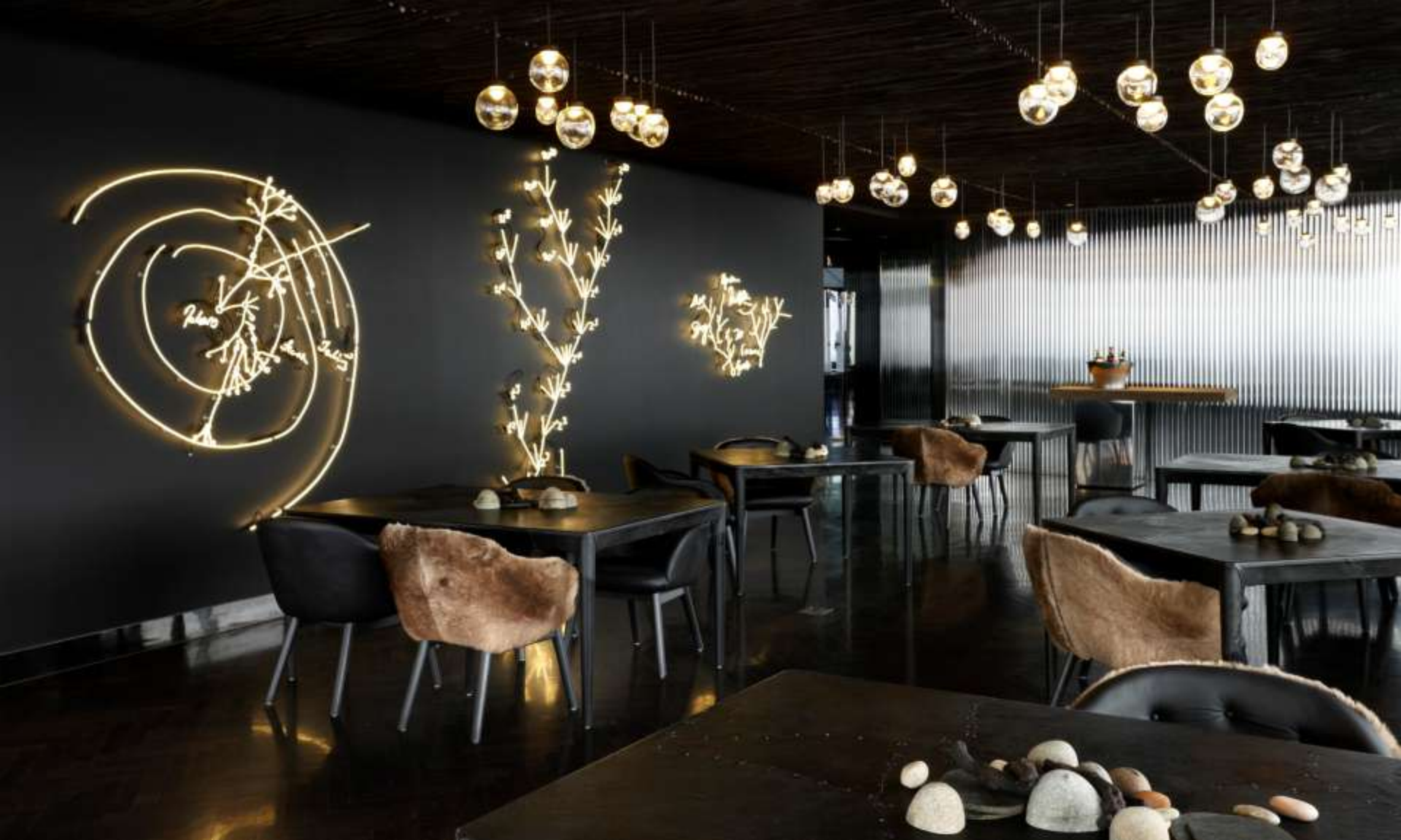
Site materials used in Vue de Monde fit-out