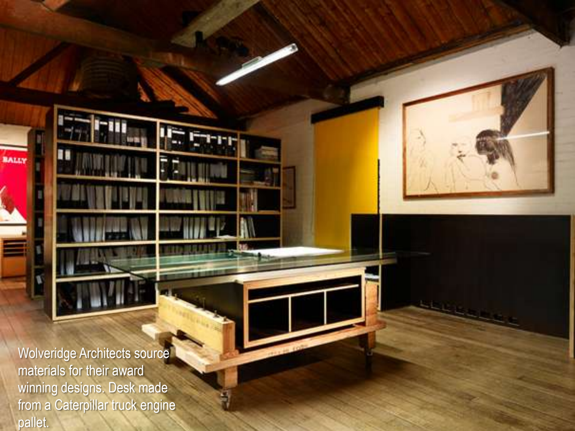
Wolveridge Architects source materials for their award winning designs. Desk made from a Caterpillar truck engine pallet.